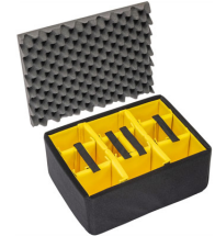
1557AirDS Padded Divider Set