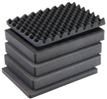
1557AirFS 5 pc. Replacement Foam Set