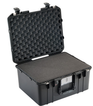
1557WF With Foam