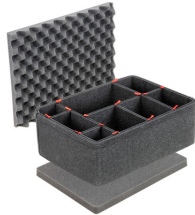
1557TPKIT TrekPak Case Divider Kit