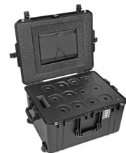
WINE-12B 12-Bottle Wine