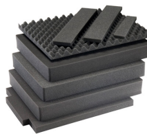
1637AirFS 8 pc. Replacement Foam Set