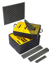
1637AirDS Padded Divider Set