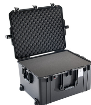
1637WF With Foam