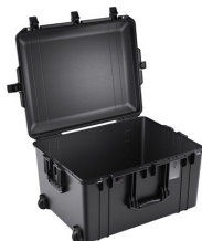
1637NF No Foam