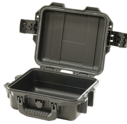
iM2050-X0000 No Foam