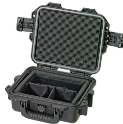
iM2050-X0002 With Padded Dividers