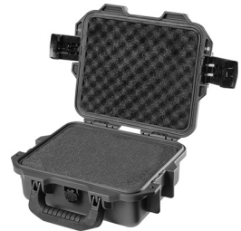
iM2050-X0001 With Foam