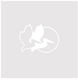
BG055TRAYRAIL Spacecase Tray