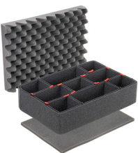
iM2300TPKIT TrekPak Case Divider Kit