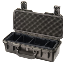
iM2306-X0002 With Padded Dividers