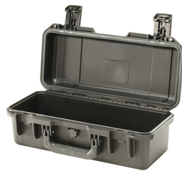
iM2306-X0000 No Foam