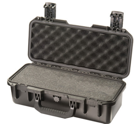
iM2306-X0001 With Foam