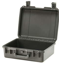
iM2400-X0000 No Foam