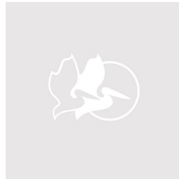
BG110TRAYBK Spacecase Tray

23215 Early Ave • Torrance, CA 90505 USA • Phone: (310) 326-4700 • (800) 473-5422 • Fax: (310) 326-3311 sales@pelican.com • www.pelican.com