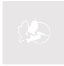
BG110TRAYBK Spacecase Tray