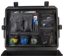
iM27XX-UTILITYORG Utility Organizer