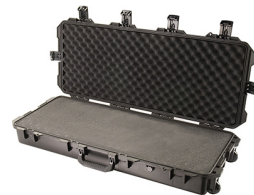
iM3100-X0001 With Foam