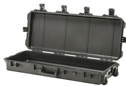
iM3100-X0000 No Foam