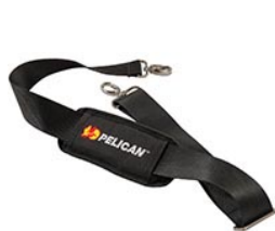
9487 Padded Shoulder Strap