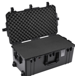
1626WF With Foam