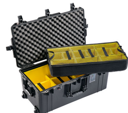
1626WD With Padded Dividers