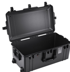
1626NF No Foam