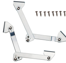
KIT-LIDSTAY-CARGO Cargo Lid Stays