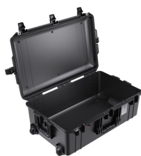
1595NF No Foam