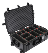
1595TP With TrekPak Divider System