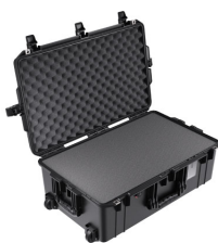
1595WF With Foam