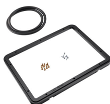
1400PF Special Application Panel Frame