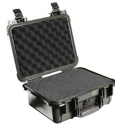
1400WF With Foam