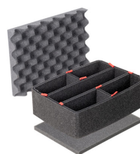
1400TPKIT TrekPak Case Divider Kit