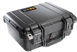
1400NF No Foam