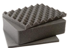
1401 3 pc. Replacement Foam Set