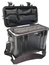
1434 With Padded Dividers & Lid Organizer