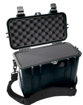
1430WF With Foam