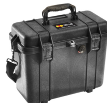
1430NF No Foam