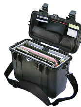
1437 With Padded Office Divider Set & Lid Organizer