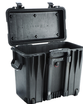
1440NF No Foam