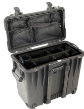
1444 With Utility Padded Divider Set & Lid Organizer