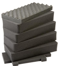
1441 6 pc. Replacement Foam Set