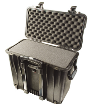
1440WF With Foam