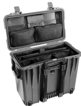
1447 With Padded Office Divider Set & Lid Organizer