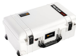
1535WWF With Foam