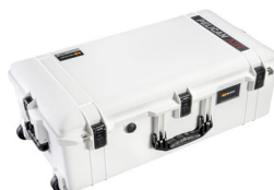
1615WWF With Foam