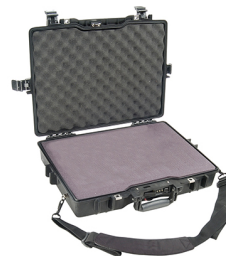
1495WF With Foam