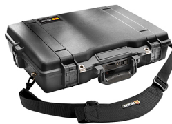
1495NF No Foam