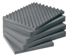
1611 5 pc. Replacement Foam Set