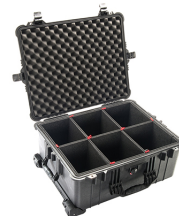
1610TP With TrekPak Divider System