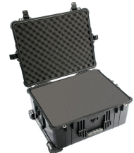
1610WF With Foam