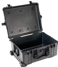
1610NF No Foam