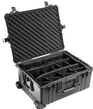
1614 With Padded Dividers