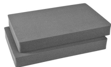
1652 Pick N Pluck™ Sections Only (set of 2)