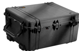
1690NF No Foam