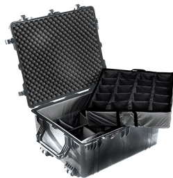
1694 With Padded Dividers