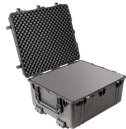
1690WF With Foam