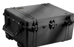
1690NF No Foam