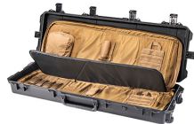
472-PWC-DW3200-BLK-COY Black Case With Coyote Soft Case