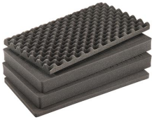
1555AirFS 4 pc. Replacement Foam Set