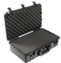
1555WF With Foam