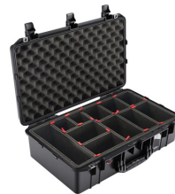
1555TP With TrekPak Divider System