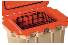
30-WB Dry Rack Basket