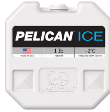
PI-1LB 1lb Ice Pack