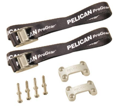
TDKIT Tie Down Kit