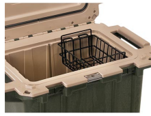
50-WB Dry Rack Basket