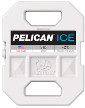
PI-5LB 5lb Ice Pack