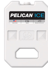
PI-2LB 2lb Ice Pack