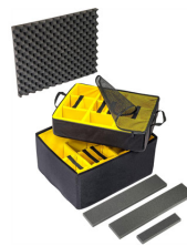
1637AirDS Padded Divider Set