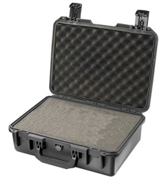
iM2300-X0001 With Foam