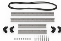
iM2300-BEZEL Base Bezel Kit