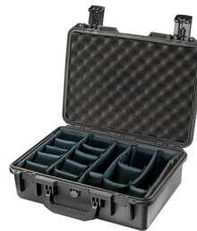
iM2300-X0002 With Padded Dividers