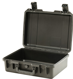
iM2300-X0000 No Foam