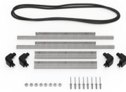
iM2300-BEZEL-LID Lid Bezel Kit