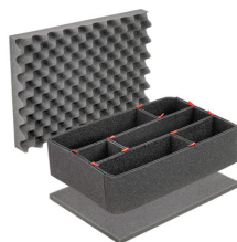
iM2400TPKIT TrekPak Case Divider Kit