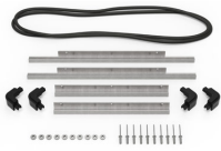
iM2400-BEZEL-LID Lid Bezel Kit