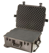
iM2720-X0001 With Foam