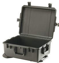
iM2720-X0000 No Foam