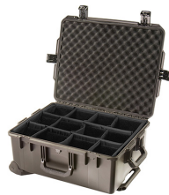
iM2720-X0002 With Padded Dividers