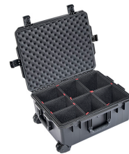
iM2720-X0006 With TrekPak Divider System