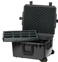
iM2750-X0002 With Padded Dividers