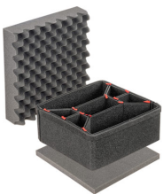
iM2275TPKIT TrekPak Case Divider Kit