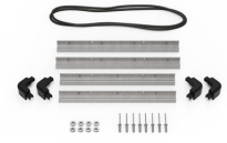
iM2275-BEZEL-LID Lid Bezel Kit