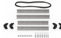
iM2275-BEZEL Base Bezel Kit