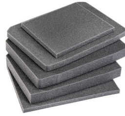
V200FS 4 pc. Replacement Foam Set