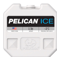
PI-11B 1lb Ice Pack