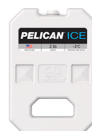
PI-2LB 2lb Ice Pack