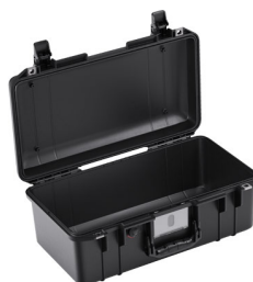
1506NF No Foam