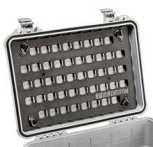
1500MP EZ-Click™ MOLLE Panel