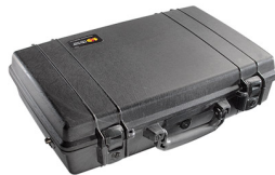
1490NF No Foam