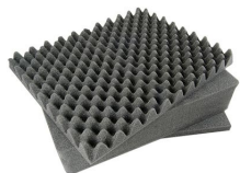
1491 3 pc. Replacement Foam Set