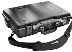
1495NF No Foam