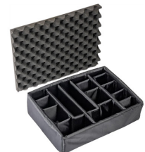
1525DS Padded Divider Set