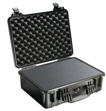
1520WF With Foam