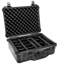
1524 With Padded Dividers