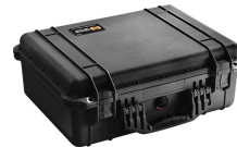
1520NF No Foam