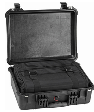
1526 With Convertible Travel Bag