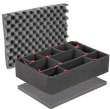
1520TPKIT TrekPak Case Divider Kit