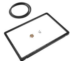
1520PF Special Application Panel Frame