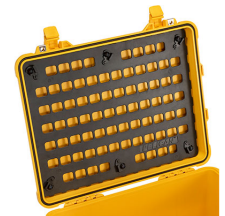
1560MP EZ-Click™ MOLLE Panel