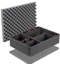
1600TPKIT TrekPak Case Divider Kit