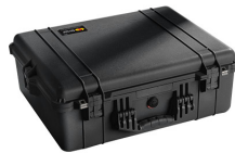
1600NF No Foam