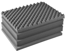
1601 4 pc. Replacement Foam Set