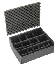
1605 Padded Divider Set