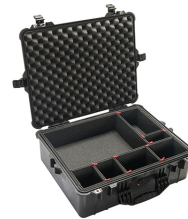
1600TP With TrekPak Divider System