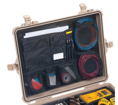
1609 Lid Organizer