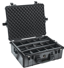
1604 With Padded Dividers