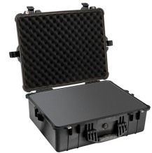
1600WF With Foam