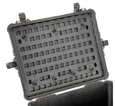
1610MP EZ-Click™ MOLLE Panel