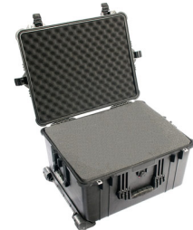
1620WF With Foam