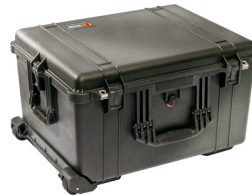
1620NF No Foam