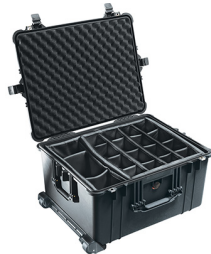
1624 With Padded Dividers