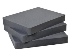
1632 Pick N Pluck™ Sections Only (set of 3)