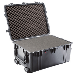
1630WF With Foam