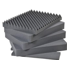
1631 5 pc. Replacement Foam Set