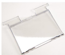
1630DC Document Container Accessory