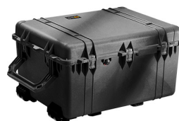
1630NF No Foam