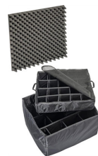
1635 Padded Divider Set