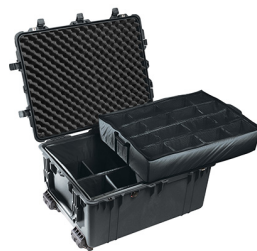
1634 With Padded Dividers