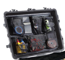
1639 Lid Organizer