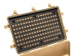
1650MP EZ-Click™ MOLLE Panel