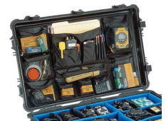
1659 Photo/Lid Organizer