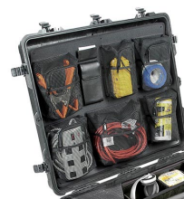
1699 Lid Organizer