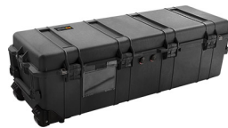
1740NF No Foam