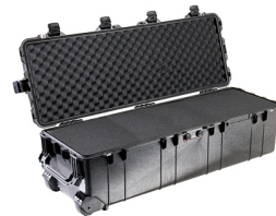
1740WF With Foam