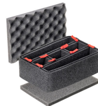
1120TPKIT TrekPak Case Divider Kit