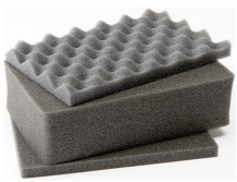
1121 3 pc. Replacement Foam Set