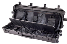
472-PWC-DW3200-BLK-BLK Black Case With Black Soft Case